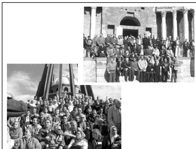
Participants of the 9 th Arab Congress of Plant Protection during the field trip around historical sites in Bousra, Southern Syria, November 2006.